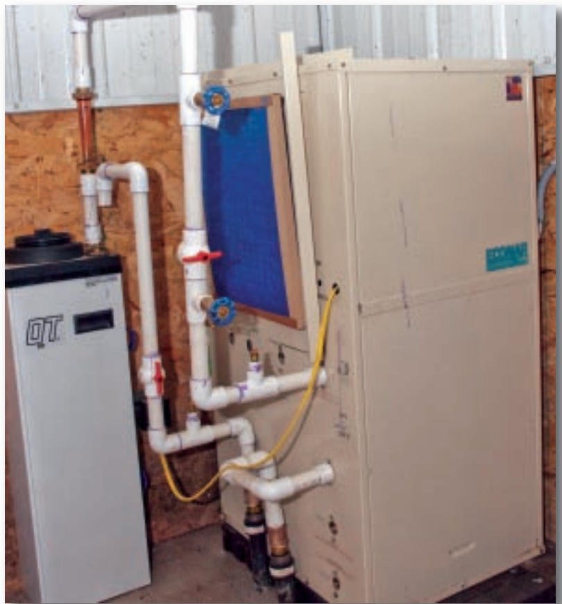
Outside in the shop, the Flecks installed a used ground-source heat pump. Kurt says the unit is ideal because he's not looking to cool the air, but rather heat the shop to about 50 degrees in the winter time.