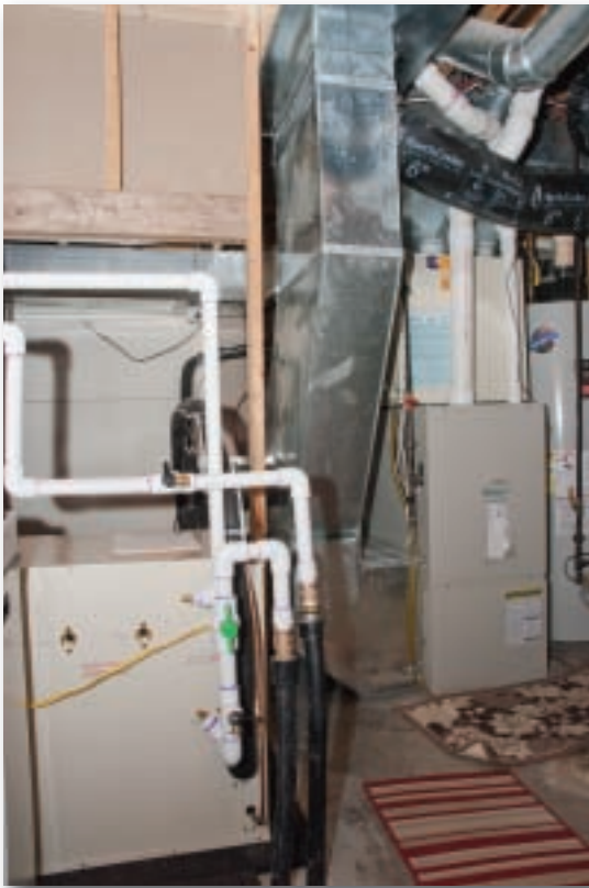
Inside the house, the Flecks retrofitted their furnace to include an Econar® geothermal system. With the split system, the Flecks use electricity as their primary source of power and propane as their back-up source.