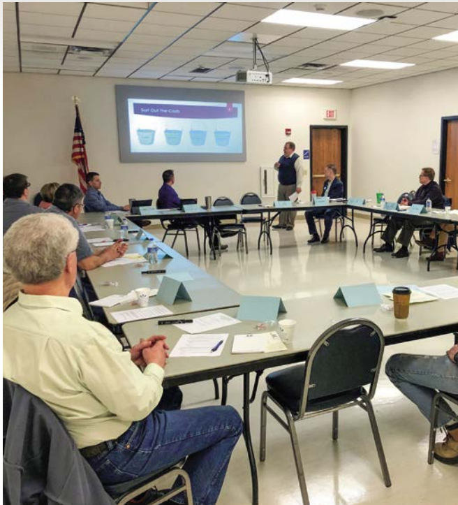
The Capital Electric Cooperative Member Advisory Committee met in Bismarck on Feb. 17. Members received updates on the co-op's operations and provided feedback on important topics, including the annual meeting and the new headquarters building.