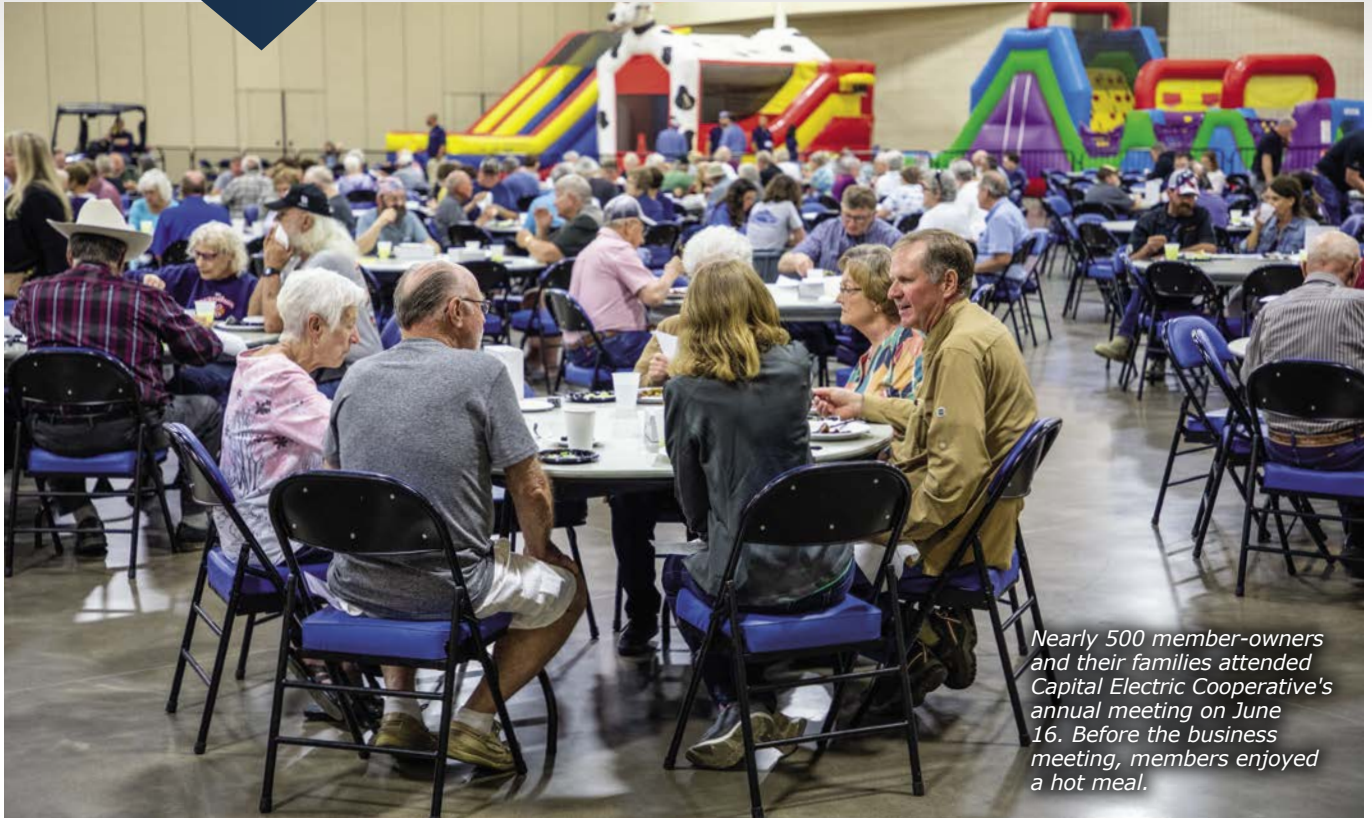
Nearly 500 member-owners and their families attended Capital Electric Cooperative's annual meeting on June 16. Before the business meeting, members enjoyed a hot meal.