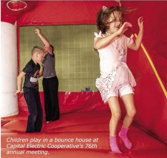
Children play in a bounce house at Capital Electric Cooperative's 76th annual meeting.

consistently ranks in the top five percentile of electric utilities around the country for reliability as measured by annual outage time per consumer. This is by design through the cooperative's long-term strategic commitment to reliability. In 2021, average outage numbers were up from 2020 due to a forced Southwest Power Pool (SPP) market blackout. This event occurred in February 2021 and impacted 60% of Capital Electric's members, who were without power for approximately 40 minutes. Despite that blackout, the total average system uptime was 99.99%.