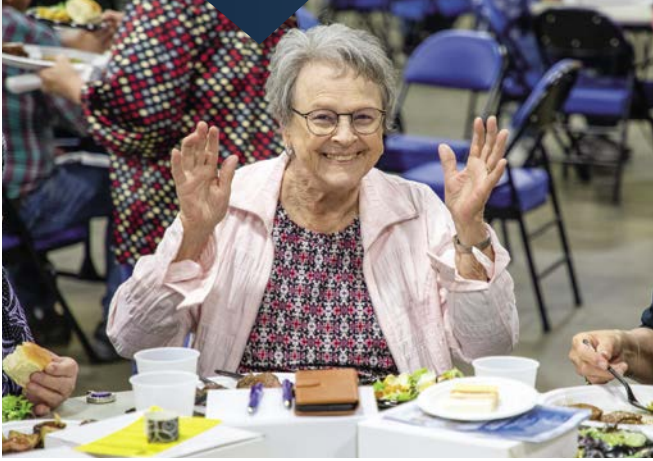
Members enjoyed a hot meal of beef medallions, roasted potatoes and green beans almondine, which was catered by the Baymont Inn and Suites.