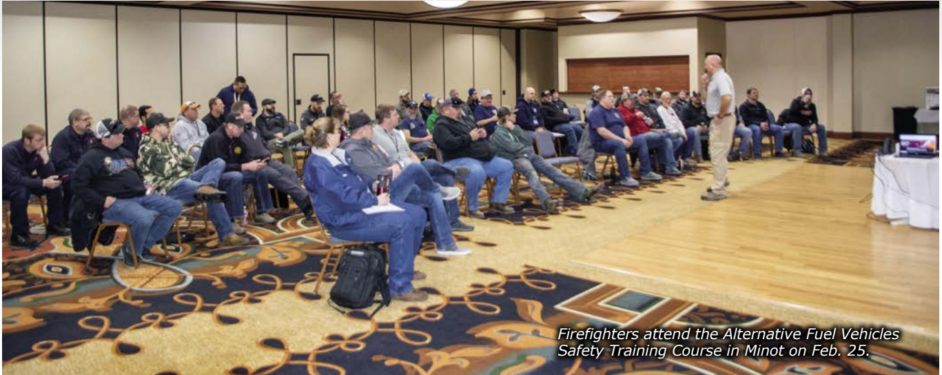
Firefighters attend the Alternative Fuel Vehicles Safety Training Course in Minot on Feb. 25.