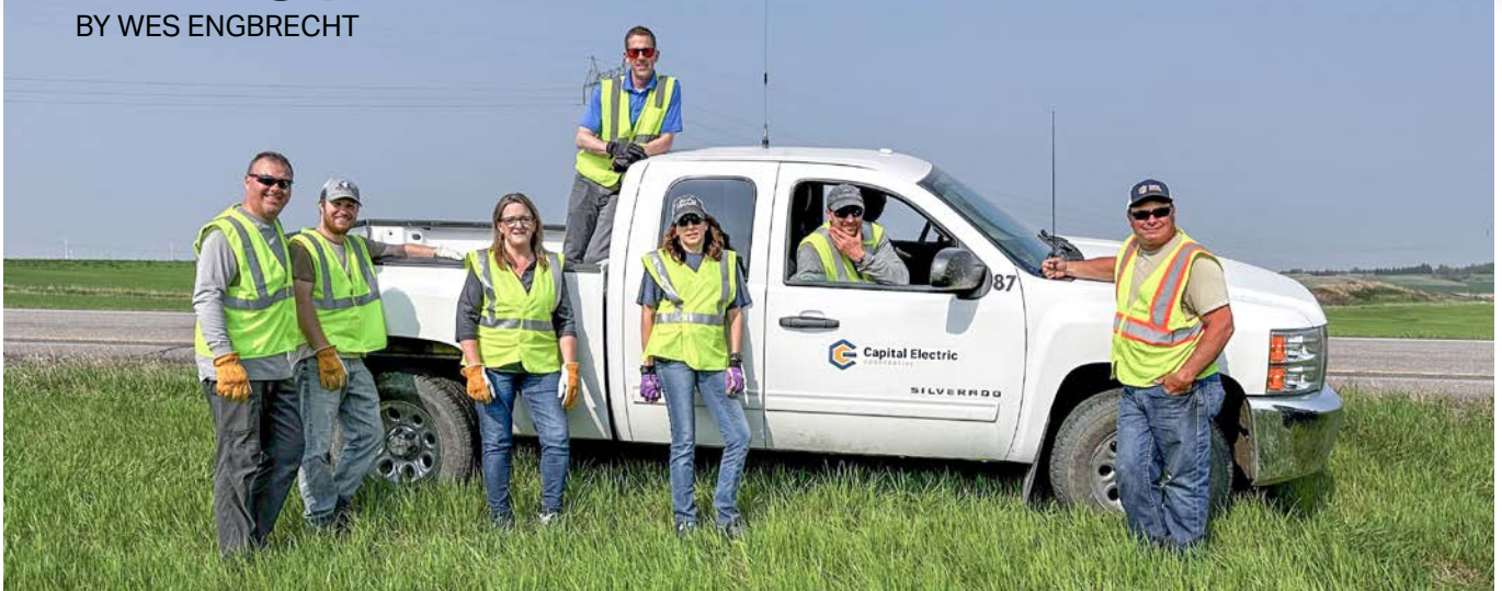
A group of the ditch-cleaning crew assembles by a Capital Electric Cooperative truck as they wrap up the morning's work.

In a busy office north of 71st Avenue in Bismarck, a group of dedicated Capital Electric Cooperative employees put their busy workday on hold to maintain the beauty of a stretch of Highway 83 heading south of their office.