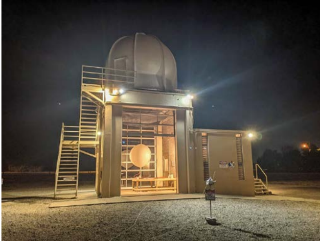
At the upper air inflation building at the National Weather Service in Bismarck, the balloon is inside the building, with the string coming out along the ground to the radiosonde (weather instrument) that is on the post in the foreground.

C an you think of a season in North Dakota when the weather doesn't pose a significant threat to people and property? You may wonder whose job it is, other than the National Weather Service, to monitor and notify us, as residents, of those upcoming weather events.