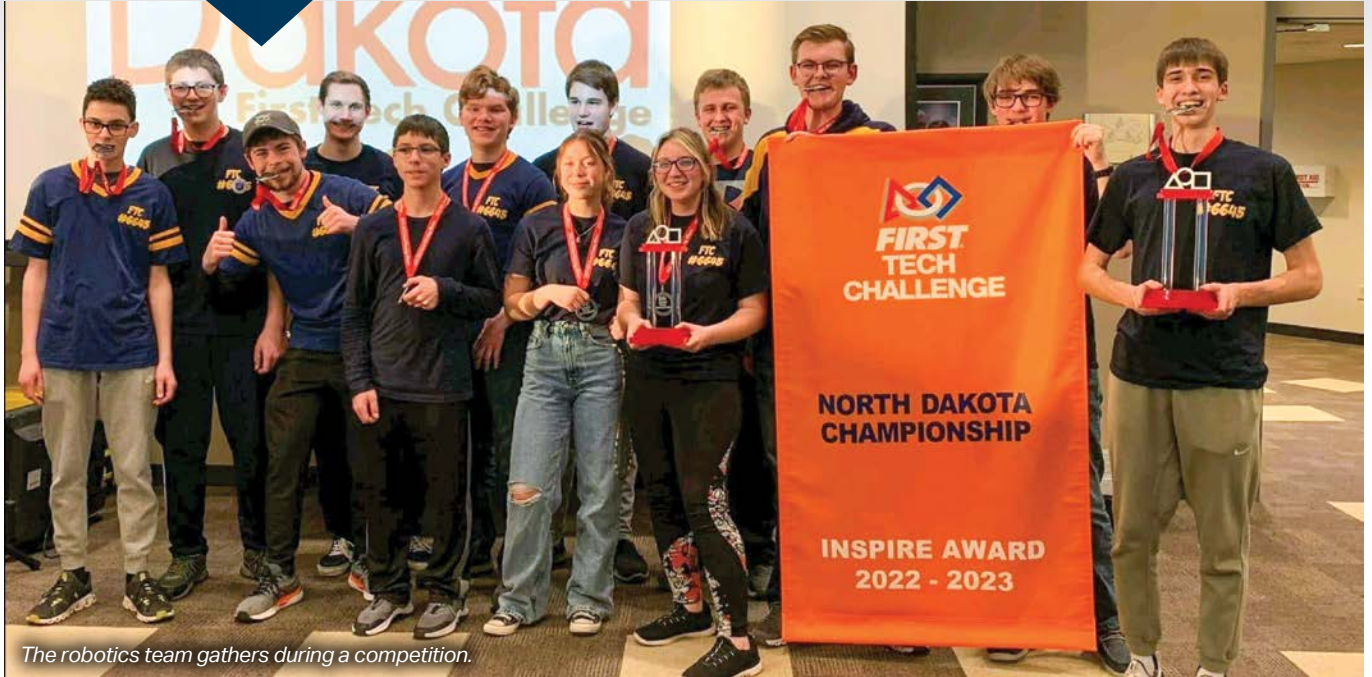
The robotics team gathers during a competition.