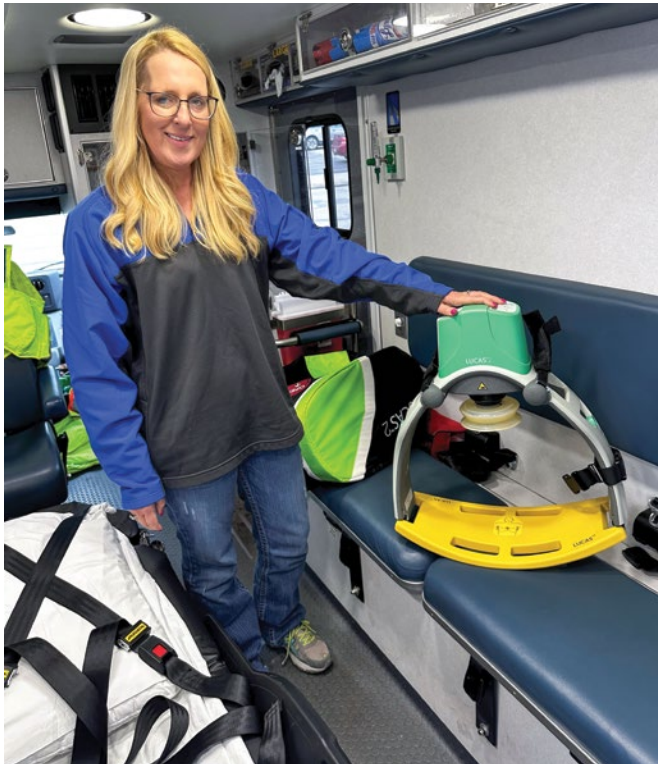
The ambulance crew has access to other updated life-saving equipment, including the LUCAS chest compression system used for cardiac arrest patients.

Serving the medical emergency needs in rural areas can be a daunting challenge. Distance to patients and hospitals, as well as severe weather and road conditions, can test the ability of both emergency medical technicians (EMTs) and the ambulance itself. Utilizing the best and latest equipment can help make this job easier.